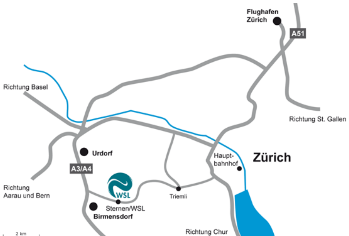
Map 1: Location of WSL