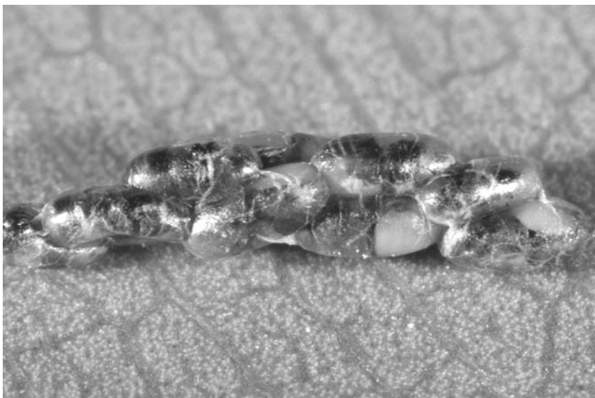
Fig. 3. Cocoon cluster of a new parasitoid, i.e. Platygaster robiniae , comprising fully developed wasps collected from Obolodiplosis robiniae galls at Birmensdorf (7.ix.2007).

(record #4) show its wide distribution in Switzerland. Most probably, it is present in low densities in most of Switzerland.