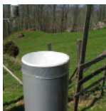
Fig. 1: Snow sampler on open field