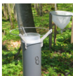
Fig. 1: Rain collector in the forest

Wet and dry deposition have been derived from chemically analysed two-weekly deposition samples of long-term forest ecosystem research (LWF) sites: