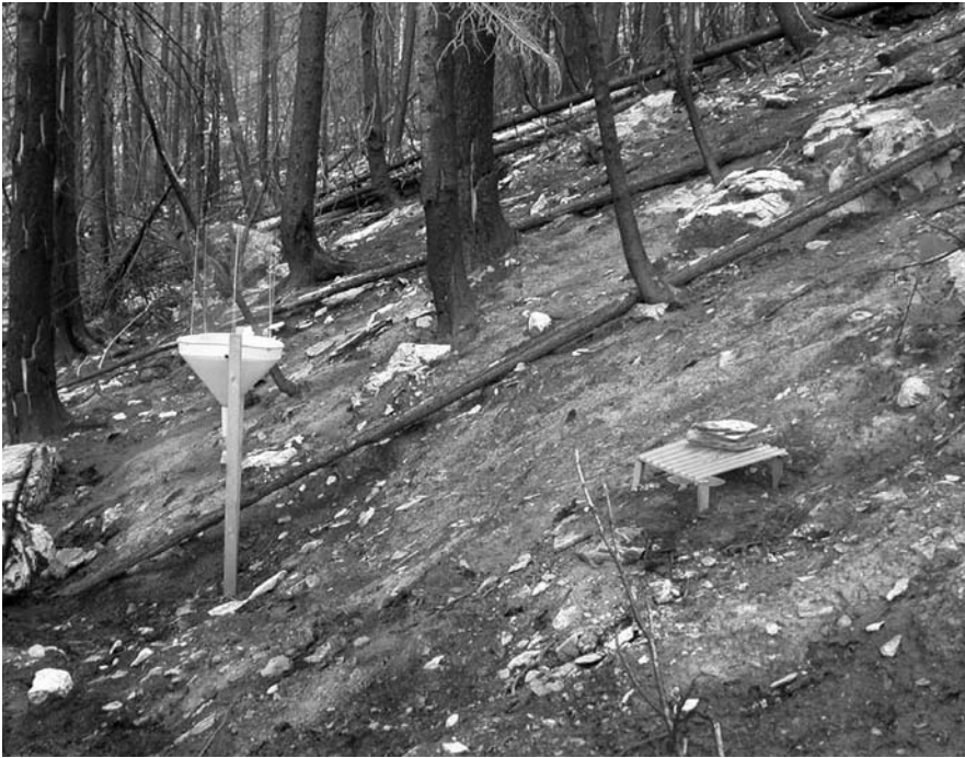
Fig. 2. Window trap and pitfall trap of a trap site in the burnt area.

The climate is continental with cold winters and dry summers (Zumbrunnen et al. 2009). Mean annual temperature decreases from 8.6 °C at 640 m a.s.l. to 5.2 °C at 1500 m a.s.l., while annual precipitation ranges from 600 mm at 640 m a.s.l. to 1000 mm at 1500 m a.s.l. (1961–1990) (Aschwanden et al. 1996). The 60-year old forest extended from a xerothermic mixed forest of oak ( Quercus pubescens ) and Scots pine ( Pinus sylvestris ) at 800 m a.s.l., to spruce ( Picea abies ) and open larch ( Larix decidua ) forest at timberline at approx. 2000 m a.s.l. (Moretti et al. 2010). Within each vegetation type the forest was homogenously structured, with the exception of small gaps of former pastures and rock outcrops. Along the altitudinal gradient, forest density and canopy coverage decreased with altitude.