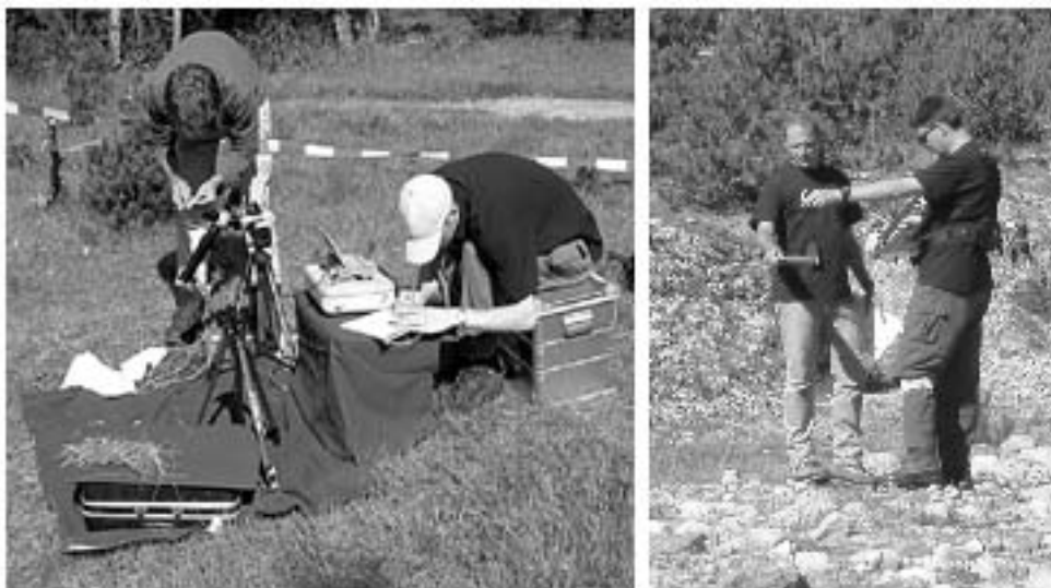
Figure 2. Spectroradiometric measurements of needle optical properties during the imaging spectrometer overflight: needle reflectance and transmittance (left), and ground reflectance (right).

The hybrid radiative transfer model (RTM) called the GeoSAIL (Huemmrich 2001) is used to describe canopy reflectance at scene level. A scene has been defined in this study as being an area of 30\ \text{m} \times 30\ \text{m} with the requirement that crown or shadow fractions are small compared to the total area modelled. The radiative transfer at foliage level is characterized by the PROSPECT model (Jacquemoud et al. 1996), which provides the foliage optical properties as a function of the biochemistry and is then subsequently coupled with the canopy RTM. The RTM GeoSAIL describes the canopy reflectance of a complete scene including discontinuities in the canopy and shadowed scene components. The RTM combines a geometric model with the SAIL model (Verhoef 1984) which provides the reflectance and transmittance of the tree crowns. The geometric model determines the fraction of the illuminated and shadowed scene components as a function of canopy coverage, crown shape and illumination angle. All trees are assumed to be identical with no crown overlap nor does the model account for mutual shading. The