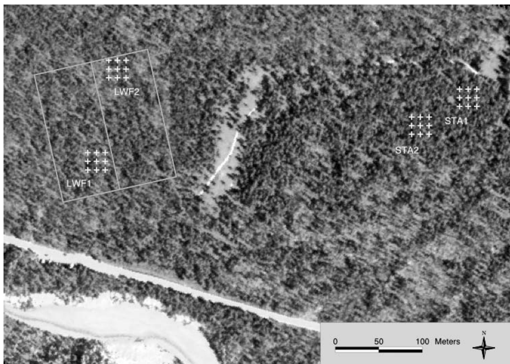
Figure 1. Airborne imaging spectrometer data acquired over the four core test sites (indicated by crosses) as part of the Ofenpass test site within the Swiss National Park (SNP). The four test sites are 20 m x 20 m in spatial extent and have been sampled with the variables listed in Table 3.

The canopy structure is measured using two canopy analyzers LAI2000 and hemispherical photographs providing canopy structure variables separately for the crown and understory layer. The clumping effects at the shoot and crown level, typical for coniferous foliage, are corrected following an approach proposed by Chen et al. (1997). Observed LAI values ranged between 1.78 and 3.99, whereas the measurement uncertainties amounted to 22%. Hemispherical photographs taken parallel to the LAI2000 measurements allowed the separation of the canopy into its constituent foliage and wood fractions, i.e., needles, trunk and branches. Forest stand characteristics such as stem density, tree height and crown radius were measured over an area of two hectares containing a total of 2456 trees. Additionally, the height of the crown