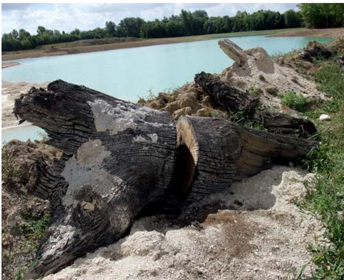
Subfossile Oak from the 6 th century, found and sampled in gravel of the river Marne, Nordeastern France.