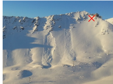
Figure 2. Spontaneous avalanche (right) and artificially released avalanche (left). The cross marks our sensor positions.

Analysis of the acoustic data revealed mostly good data quality and also the conditions for a true power law distribution (Clauset et al., 2009) were mostly fulfilled. The values of the exponent \beta were surprisingly constant with a value of approximately 3.5 for nights with stable snow conditions but also for nights when avalanche triggering by explosives was successful the following morning. In the night of 11-12 December 2012, a spontaneous avalanche released on the slope next to our sensors (Fig. 2), meaning that the slope was truly in an unstable (critical) state. In this night we measured acoustic data of high quality and computation yielded an exponent \beta of 2.5.