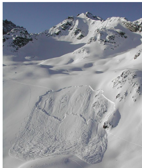
Fig. 1: Dry-snow slab avalanche

following only focus on the formation of this type of avalanche (Figure 1). Such avalanches result from a sequence of fracture processes including (i) failure initiation in a weak layer underlying a cohesive snow slab, (ii) the onset of crack propagation,