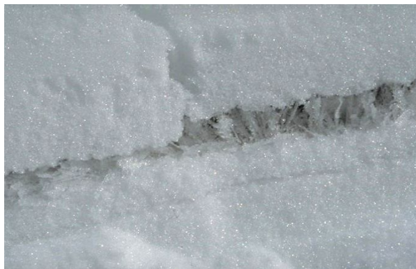
Fig. 3: This photograph of a collapsed surface hoar layer is probably the most influential and has triggered many ideas and debates over the last 15 years (from Jamieson and Schweizer 2000).

Hence, under most conditions snow failure under mixed-mode loading is due to shear failure. However, when considering the microstructure of snow, high local stress concentrations may occur (Schneebeli 2004) leading, e.g., to tensile failure. In other words, at the scale of bonds, any failure mode seems possible (Schweizer and Jamieson 2008). In this context, it is important to note that the collapse of weak layers that is observed after failure follows from the structural damage in the highly porous microstructure of weak layers during crack propagation (Figure 3). Collapse is not a failure mode but a consequence of failure. The fact that there is vertical displacement does by no means imply that there was a compressive failure 1 .