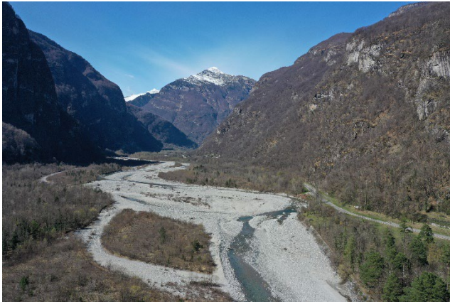
Maggia at Someo, TI