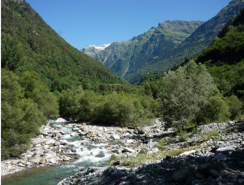
River Moesa with the Castello Mesocco upstream